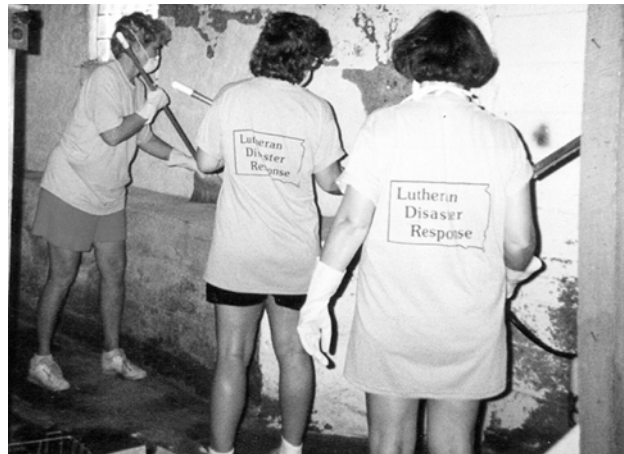
Lutheran Disaster Response volunteers provide clean-up services following a major flood.

LDR provides for immediate disaster response, in both natural and technological disasters, long-term rebuilding efforts, and support for preparedness planning through synods, districts, and social ministry organizations. The disasters to which LDR responds are those in which needs outstrip available local resources. LDR provides for the coordination of 6,000 volunteers annually. In addition, LDR provides crisis counseling, support groups, mental health assistance, and pastoral care through its accredited social service agencies.