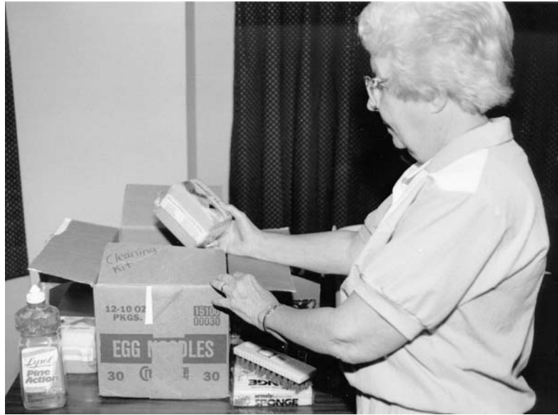
The Church World Service Disaster Response program provides clean-up services following disasters with kits containing soaps, sponges, brushes, etc.

CWS Disaster Response assists disaster survivors through inter-religious partner organizations in the U.S. and worldwide on behalf of its 32 member communions plus affiliated agencies. CWS Disaster Response is comprised of consultants who help convene local churches and religious organizations to form an interfaith organization to coordinate responses to unmet needs during the recovery phase.