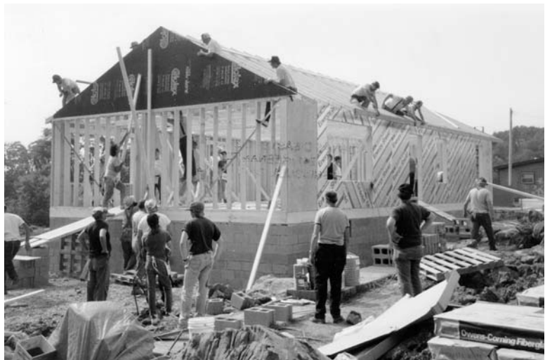
Friends Disaster Service volunteers rebuild homes in Shadyside, Ohio, in 1990.

FDS provides clean-up and rebuilding assistance to the elderly, disabled, low income, or uninsured survivors of disasters. It also provides an outlet for Christian service to Friends' volunteers, with an emphasis on love and caring. In most cases, FDS is unable to provide building materials and, therefore, looks to other NVOAD member agencies for these materials.