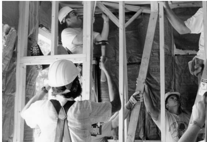
Volunteers from Presbyterian Disaster Assistance rebuild a church in Boligee, Alabama, that was destroyed by arson.

PDA works primarily through Church World Service in providing volunteers to serve as disaster consultants and funding for local recovery projects that meet certain guidelines. This agency also provides trained volunteers who participate in the Cooperative Disaster Child Care program. On a local level, many Presbyterians provide volunteer labor and material assistance.