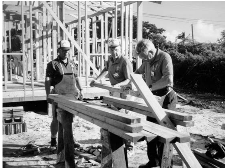
Volunteers from Christian Reformed World Relief Committee help with rebuilding efforts in Antigua in 1996.

CRWRC's Disaster Response Services has the overall aim of assisting churches in the disaster-affected community to respond to the needs of persons within that community. CRWRC provides advocacy services to assist disaster victims in finding permanent, long-term solutions to their disaster-related problems, as well as housing repair and construction, needs assessment, clean-up, child care, and other recovery services.