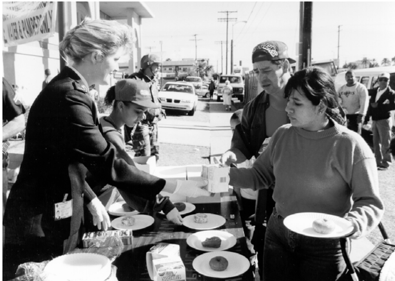
The Salvation Army distributes food and beverages to disaster victims during the response phase following the Northridge Earthquake.

This is typically the disaster phase you see most often on television and read about in the newspapers. A disaster has occurred, or is imminent, and all available resources have been mobilized to help protect life and property. Response activities occur immediately before, during, and after an emergency or disaster. Examples include search and rescue, implementation of shelter plans, set up of first aid stations, and the distribution of food and water.