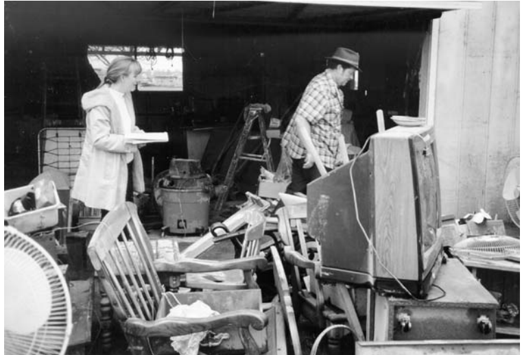
Mennonite Disaster Services volunteers assess damage after the 1996 flood in Yuba, California.

MDS assists disaster victims by providing volunteer personnel to clean up and remove debris from damaged and destroyed homes and personal property and to repair or rebuild homes. Special emphasis is placed on assisting those less able to help themselves, such as the elderly and handicapped.