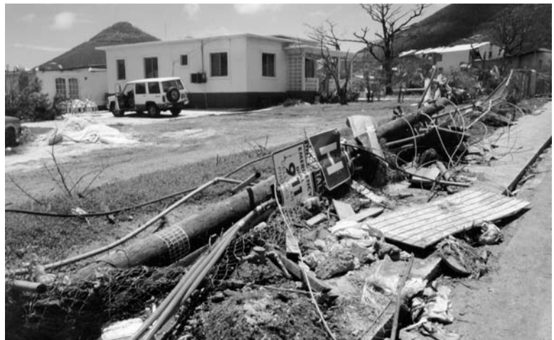
The American Radio Relay League responds when communication lines are damaged or destroyed during disasters.

ARRL is a national volunteer organization of licensed radio amateurs in the United States. ARRL-sponsored Amateur Radio Emergency Services (ARES) provide volunteer radio communications services to Federal, State, County, and local governments, as well as to voluntary agencies. Members volunteer not only their services but also their privately owned radio communications equipment.