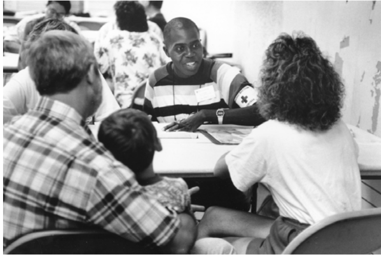
An American Red Cross volunteer assists a disaster-affected family following Hurricane Hugo.

The American Red Cross is required by Congressional charter to undertake disaster relief activities to ease the suffering caused by a disaster. Emergency assistance includes fixed/mobile feeding stations, shelter, cleaning supplies, comfort kits, first aid, blood and blood products, food, clothing, emergency transportation, rent, home repairs, household items, and medical supplies. Additional assistance for long-term recovery may be provided when other relief assistance and/or personal resources are not adequate to meet disaster-caused needs. The American Red Cross provides referrals to the government and other agencies providing disaster assistance.