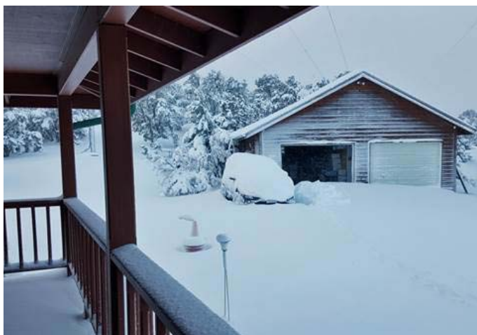
W7RN, near Virginia City, NV, was pretty much unreachable for the author. January can present stern challenges to travelers through the Sierra range.

Your humble correspondent can only blame the weather this year for a forced hiatus from the RTTY Roundup. After several hours spent slowly gaining the pass at Echo Summit - all other Sierra Nevada passes being completely shut down by something like 50 feet of this white scourge - I arrived back in cell phone range only to find out that the road to my mountaintop operating position at W7RN near Reno, NV was completely impassible. Even though my contest club-mates told me, "You picked a good one to miss!" there was nothing to be done but hunker down to play some Texas Holdem and drown my sorrows.