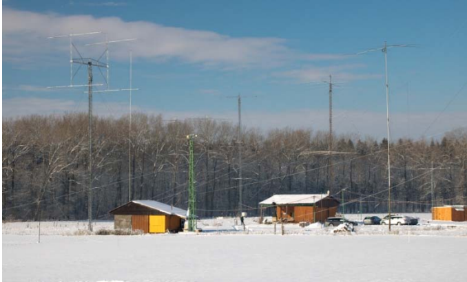
"After all it was nice contest with a few visits of Murphy, nice BBQ in minus 25°C and some vodka drinks!"

Challenging cold conditions weren't limited to the great white north, as Larry, K4KGG relates: