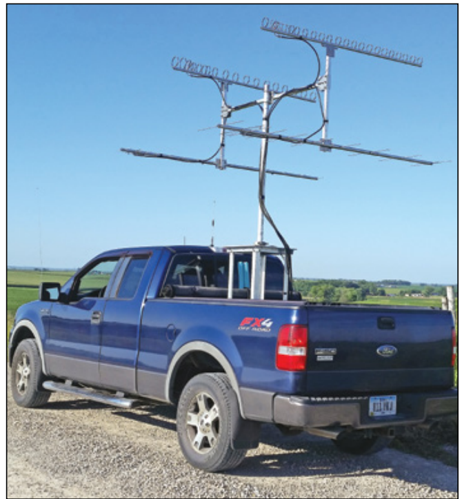
Wyatt, AC0RA, took advantage of summer propagation, good road conditions, and a lot of unique grids to get the highest score of the entire contest.