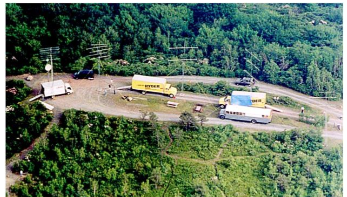
A historical aerial view of W3CCX from 1999. All this work, and yet they keep on doing it!