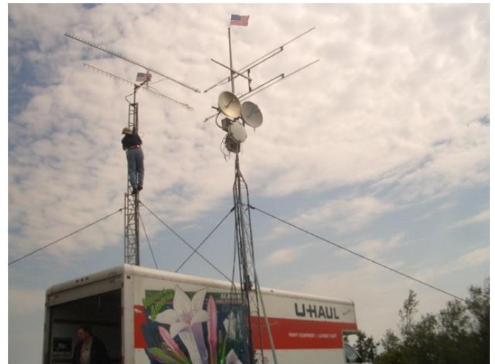
Erecting the microwave station at W3CCX

they set the limits of what's possible for VHF+ contesting. The Limited Multiops (L) range from a few operators manning a home station to huge efforts with many ops and multiple antenna systems. They both provide a place where folks without a big station can have the fun of operating while enjoying time with other hams who also enjoy VHF+ contesting. They also provide a place for future operators to learn such as the WA2CP Camp Pouch Boy Scouts will attest – read the short story below! We need more of them on both coasts as well as here in the black hole of the Midwest where all the old guard, huge effort multiop stations have shut down.