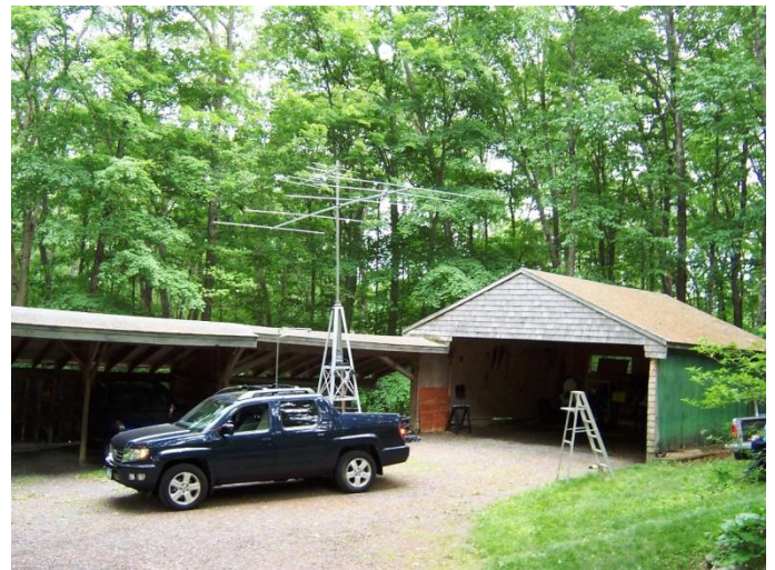
Now THAT is a sturdy mount for a rover antenna! Dave, NN1N decided to create a serious mount for his trip to super-rare FN67 in Maine, along with FN78 and FN79 in Quebec. That roof tower tips over but holds up a 5-element 50 MHz beam plus beams for 144 and 432 MHz.

Four stations in the June VHF contest had 100 or more QSOs on 222, all of them multiops, with W2SZ (M) topping the list at 129. Six stations had 432 QSO totals over 100, five multiops once again with W2SZ on top at 186. Jeff K1TEO (SOHP) is also on this list at 121. No real enhancement was reported by anyone on 432 and up.