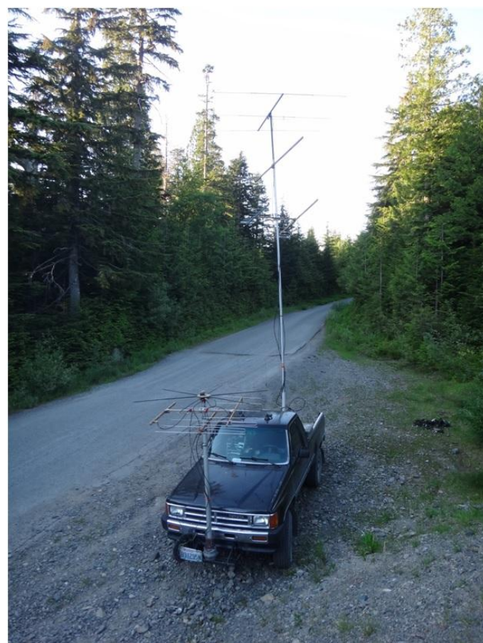
WW7D/R took to the hills to activate CN98 from this location at 3,000 feet elevation.

There were 11 entries this year in the Unlimited Rover category (RU). While these stations can carry as many bands as they wish and can work as many other rovers as many times as they wish, few entrants now in this category seem to fully embrace the intent of this category that allows multiple operators, pack roving and grid