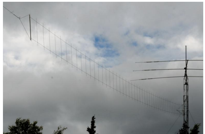
Aimed at the US West Coast, this 50-element, rope-mounted Yagi didn't have a lot of success this year but you can't fault KL7NN for trying! The antenna can be flipped from vertical to horizontal to take advantage of whatever polarization is best.

Modest stations with 100-200 W “bricks” (amplifiers) have always comprised the bulk of contest activity since well before the Low Power category was established so it's no surprise that once again the Single-Op, Low Power (SOLP) category proved to be most popular. The SOLP category has been big hit since it was introduced back in 2000.