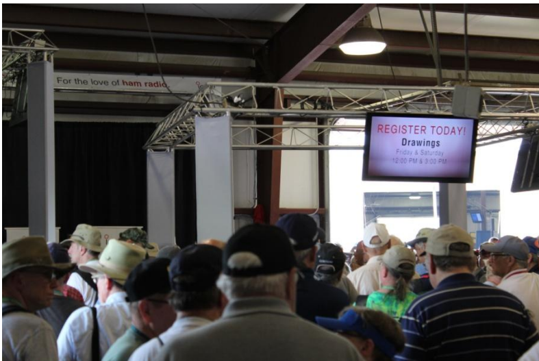
Figure 11 Everyone waiting for Icom's twice daily give away