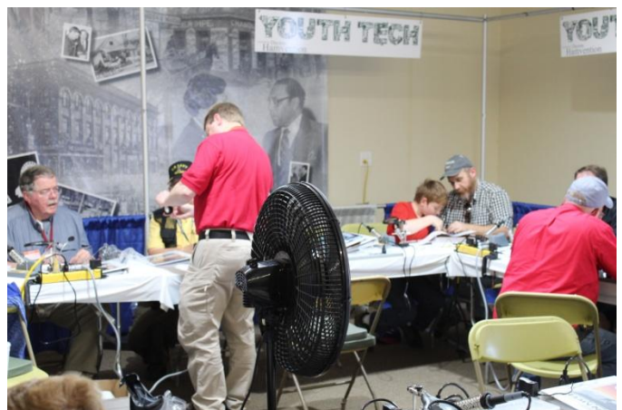
Figure 2 Teaching youngsters how to solder