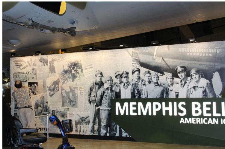
Figure 10 Favorite stop in Dayton - Air Force Museum and the Memphis Bell exhibit.