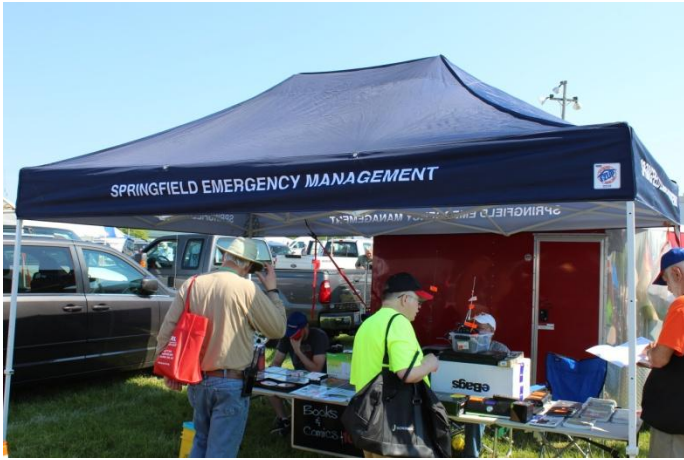
Figure 3 Does your EMA do this?