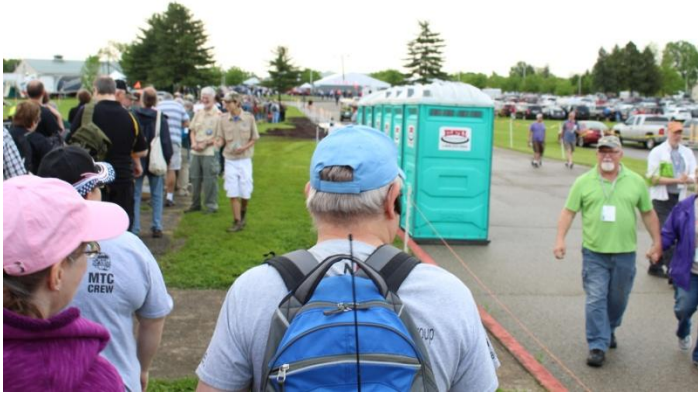
Figure 5 Xenia Friday Morning - pre opening.