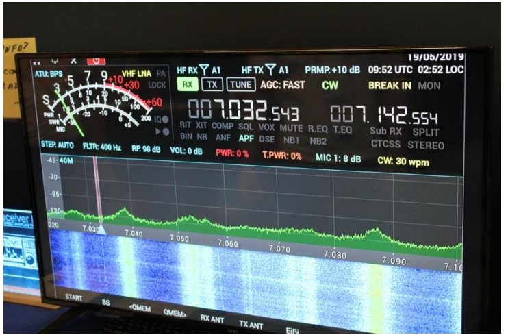
Figure 13 SDR Rig Displays